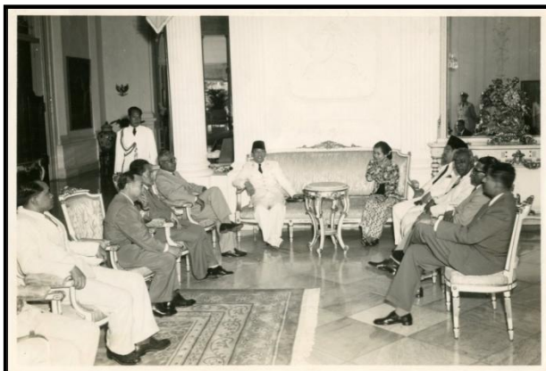
Prime Minister of Ceylon, Sir John Kotelawala and members of delegates on